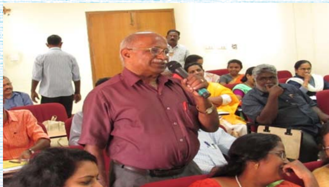
Coordinator, SC1402 interacting during the Coordinators Meeting