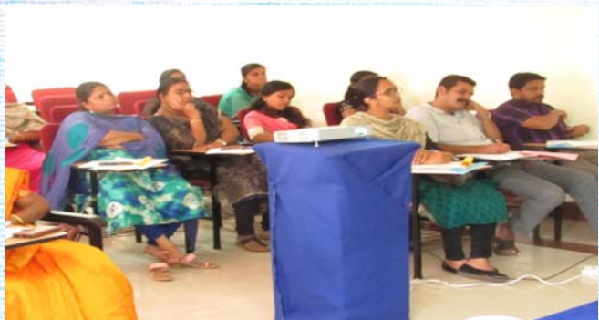
Participants from Newly Established SC14184 at the Orientation programme