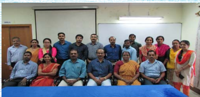
IGNOU officials and participants from Newly Established SC14185P, ICAR-CIFT during the Orientation Programme