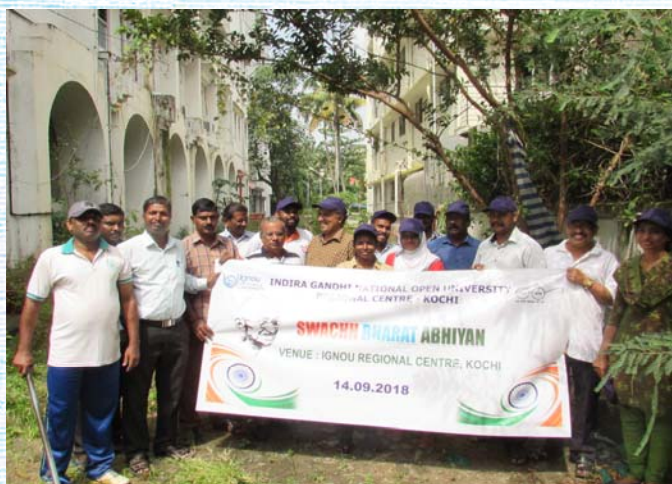
Staff of RC and REC participating in Swachhta Bharat Abhiyan at RC campus