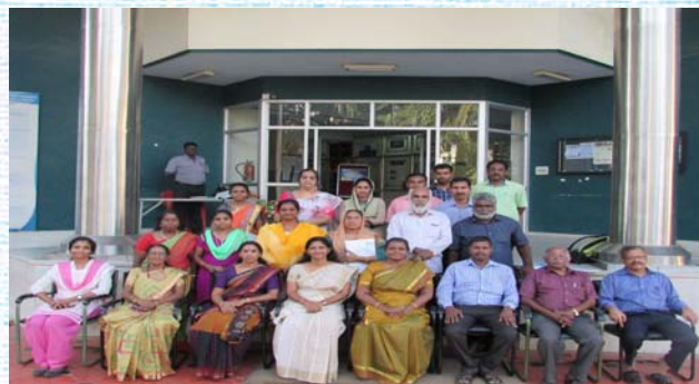
IGNOU Regional Centre officials and Coordinators/ PICs during the 36 th Coordinators Meeting