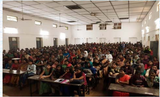
Learners present during the Induction Meeting at SC 1407, Sree Kerala Varma College, Thrissur