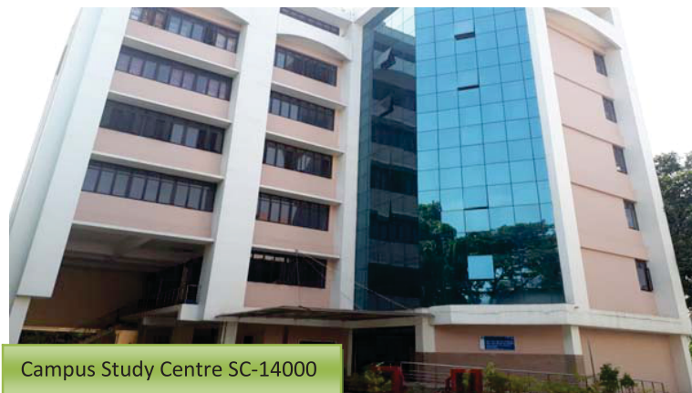
Campus Study Centre SC-14000