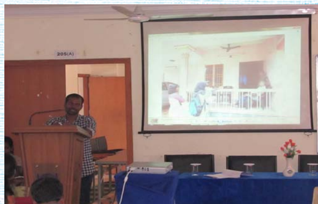
Swachhta Bharat Internship student makes a presentation on his field work report