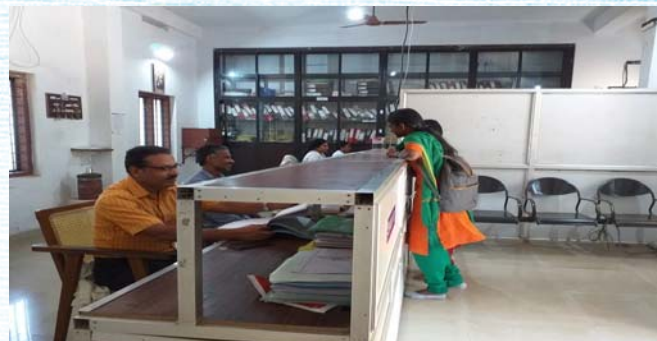
Learners seeking information at the office of SSC 14182